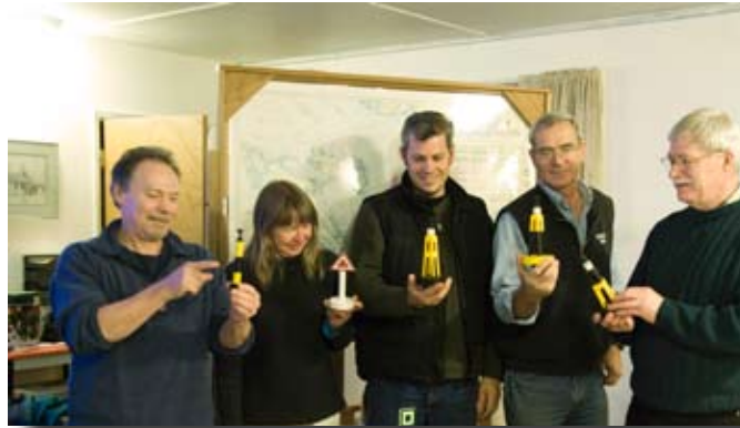
Some of the students pondering the secrets of navigation aids